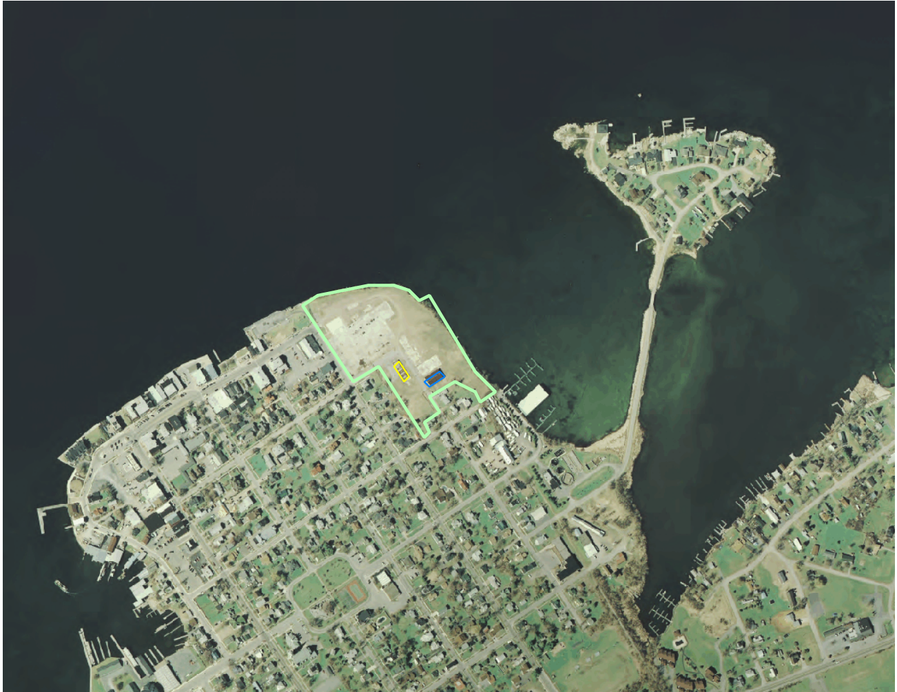
Figure 3 2006 True Color Satellite Photograph

Only two buildings remain at the site. A storage building, outlined in blue, and the building used as the field work command post and decontamination garage for equipment leaving the site, outlined in yellow. Excavation of the site followed in 2007 through 2009. All of the buildings were removed by January 2009.