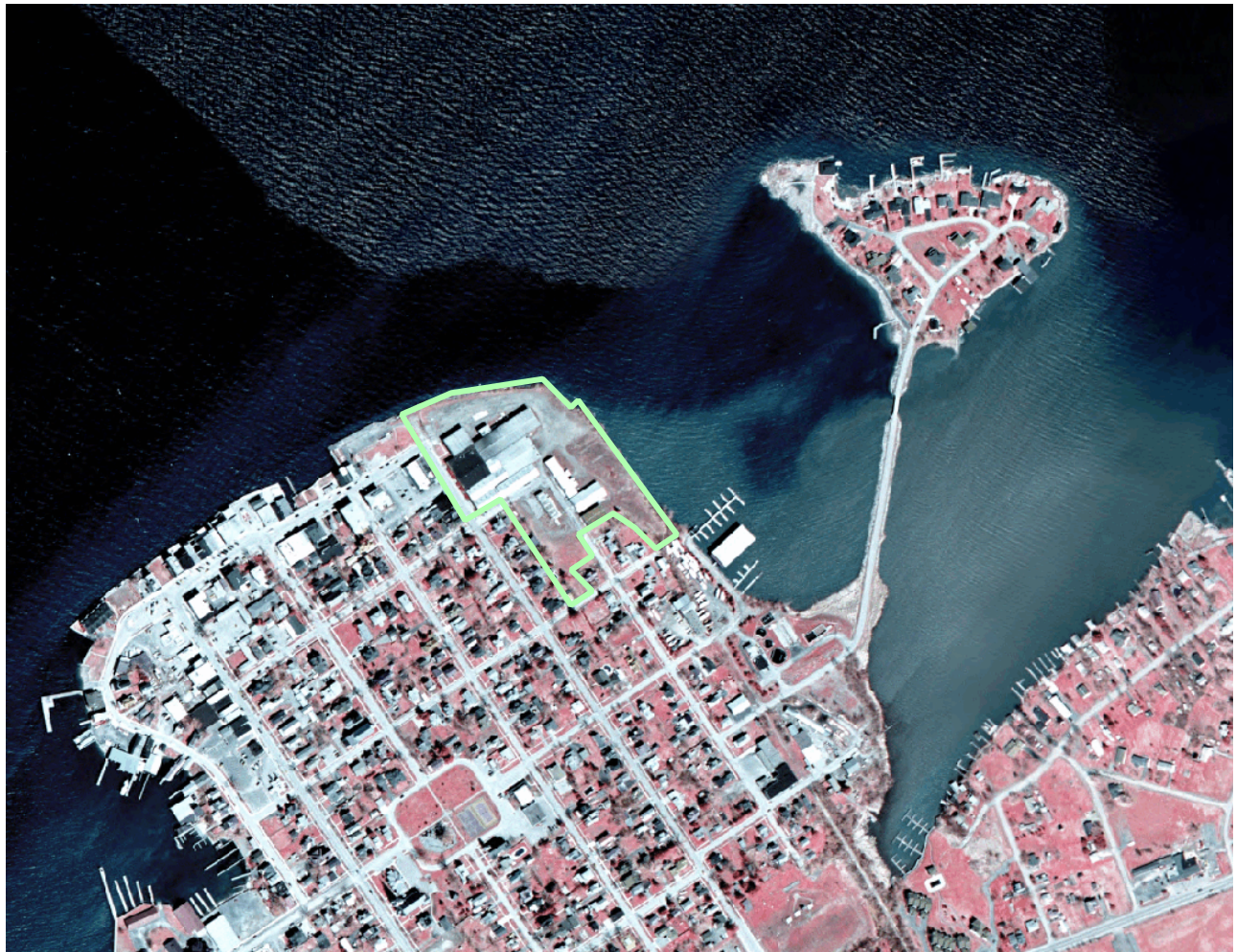
Figure 2 2003 Infrared Enhanced Satellite Photograph

This is a representation of the site prior to any work being completed under the ERP.