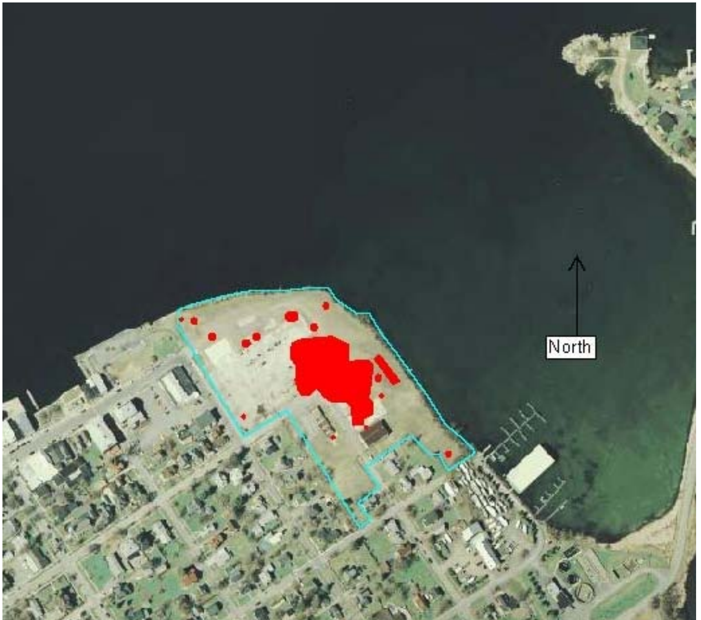
Figure 4 2006 True Color Satellite Photograph (enlarged)

Locations that were excavated to remove contaminated soils are approximated by the red shaded areas. More detail is included in the documents available at the repositories listed on page 3.